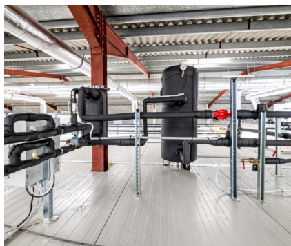
The Daikin solution provides temperature control according to each area's requirements using a range of systems.

A communication gateway runs from the transcritical system to each evaporator, connected via a central management system from PC to laboratory, to Froid Cuisine and Tewis.