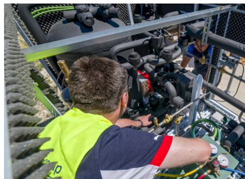
The transcritical CO 2 system provides sustainable, energy efficient refrigeration in keeping with Biocoop's aims.